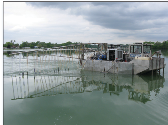
Figure 1. Officials apply alum and sodium aluminate to Carter Lake.

Iowa Department of Natural Resources (IDNR) and NDEQ prepared a total maximum daily load for algae/algal toxins, chlorophyll a , total phosphorus, total nitrogen and pH at Carter Lake in 2007. Nutrient sources were linked to nonpoint source runoff from the watershed and from the organic-rich sediment in the bottom of the lake. Lakebed sediments were frequently resuspended by boat wakes and the bottom-feeding activity of rough fish (such as carp, quillback and bullheads).