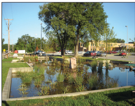
Figure 2. The city of Carter Lake installed five rain gardens to treat stormwater runoff.

Other work that will be implemented includes adding stormwater detention cells, installing grass swales, creating wetlands, stabilizing the shoreline, performing targeted lake dredging and conducting a second alum treatment. Partners expect to completely implement the restoration efforts described by the plan in 2013.