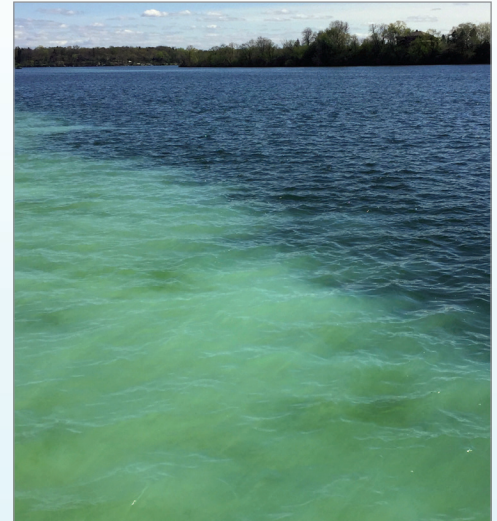
Subsurface Formation of Flocc

Bald Eagle Lake is 1,071 acres in size and is located just north of the Twin Cities near the town of White Bear Lake, MN. The Rice Creek Watershed District partnered with Wenck Associates to complete a Total Maximum Daily Load (TMDL) study and determined Bald Eagle Lake was impaired/threatened by an excess of phosphorus. The watershed district contracted with HAB Aquatic Solutions to conduct